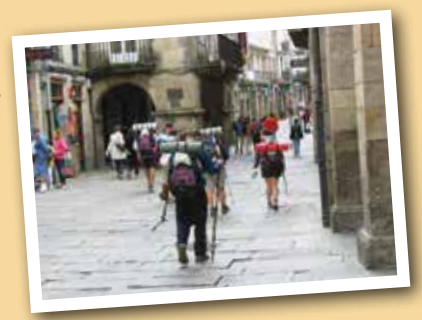
Camino Pilgrimage -Santiago de Compostela

Make your booking today via the contact details below. Contact the tour leader Paul Skippen on 0412 850 883 NOW!